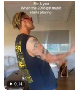
Will 2026 Feel Like 2016? A Nostalgic Reflection TikTok · jadenboisenmusic