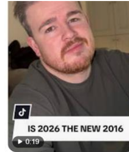
2026 Is the New 2016: A Nostalgic Look Ahead TikTok · eoghanquigg